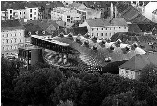
Figure 12. Kunsthau Graz of Cook and Fournier

innovations in computer technology and advancements in manufacturing have helped Cook realize his ‘alien’ vision. Following on from this trend, Zaha Hadid makes a shift from her early work towards a more fluid geometry and glossy finishes by the mid of the decade. 26 In her design for the Nordpark Railway Station entrance, completed in 2007, Hadid employed the advancements in the glass industry to generate a glossy finish for her complicated and fluid design. She explains, “new production methods like CNC milling and thermoforming guarantee a very precise and automatic translation of the computer generated design into the built structure.” 27 This statement indicates a strong influence of computer technology in generating form that later formulate the glossy surface within this particular building. This technological experimentation, somehow, has implied that the glossy effect is often correctly associated with the complex geometry developed through computers.