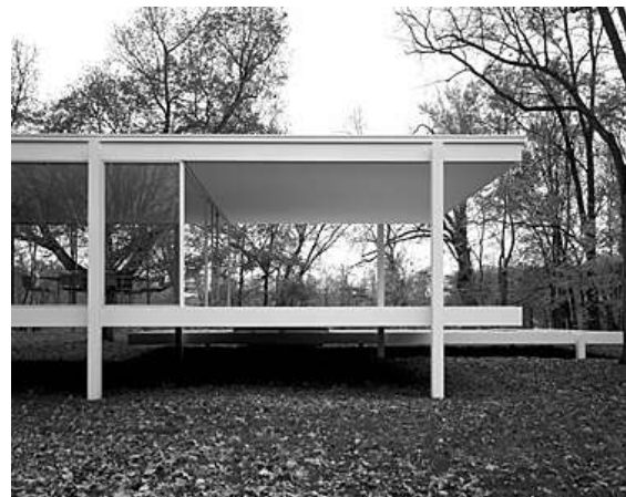
Figure 05. Farnsworth House

Starting from the 1950s there has been a gradual shift in societal norms that have allowed for a shift from the previously discussed ideas of transparency to those of glossiness. In the post-war years the dissatisfaction with the war and the turn towards democracy guided many developments in society. Accordingly, the euphoria of democracy was also captured in architecture through the use of surfaces that promoted transparency, thereby bringing new light for a better life. 16 This shift was exemplified in the post-war works of Mies van der Rohe, in a domestic project, Farnsworth House, completed in 1951, celebrated the concept of "live openly" 17 by engaging transparent surfaces for its walls. Another important structure in a public building, by Mies van der Rohe, the Seagram building, which was completed in 1958, used transparent surfaces to celebrate characteristics of honesty and democracy. Mies took advantage of the growing glass and steel industry and developed this new aesthetic which found support in the post-war economic context.