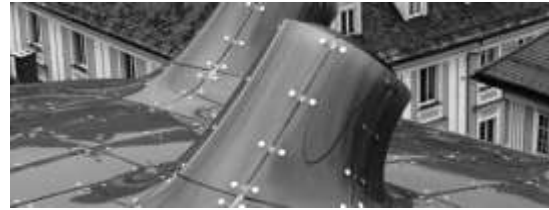
Figure 13. Kunsthau Graz’s glossy glass surface (Source: http://www.austria.info/au/culture-arts/kunsthau-graz-1140943.html )