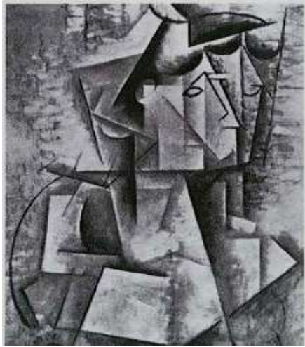
Figure 01. L' Arlesienne