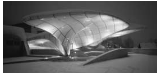
Figure 14. Nordpark Railway Station entrance of Hadid (Source: http://www.zaha-hadid.com/architecture/nordpark-railway-stations/ , photographed by Werner Huthmacher )