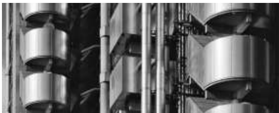
Figure 09. The glossy surface of Lloyd Building

Michael Hays argues that by the 1980s the development of mass media, first as television and then through computers, had led to the rise of a consumer culture and affected the way we perceived the world. Being dictated by the marketplace meant that architecture too had to be manipulated to attract people and sell itself to the public.