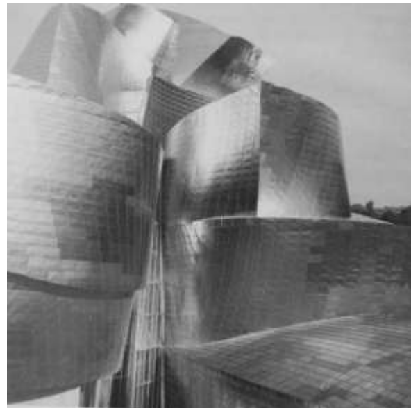
Figure 11. Up close view of Guggenheim’s titanium surface

Moving into the 21st century the rising interest in glossy surfaces gets further support from Peter Cook and Colin Fournier’s project for the Kunsthhaus in Graz, Austria completed in 2002. Here Cook reinterprets his idea of the walking city, which was proposed in 1960s by Archigram, into a single unit of Kunsthhaus geometry. The technological limitations of the 1960s seem to have been overcome by this time, as