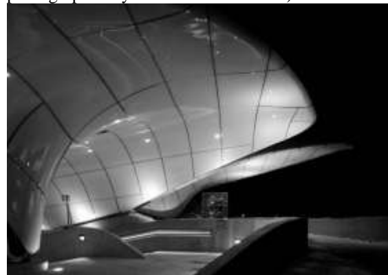
Figure 15. Nordpark Railway Station’s glossy curve glass

Therefore, looking over the last few decades of architectural development we can say that the experiments that began in the middle of the 20 th century with the Sydney Opera House, and then continued with by the Lloyds building has eventually led to an architecture that perceives its surface materiality quite differently. The advancement of computers in the design and