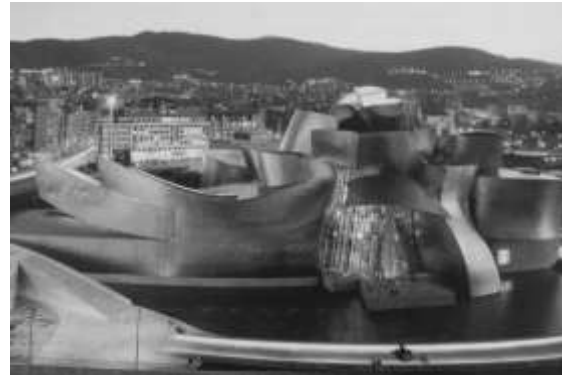
Figure 10. Guggenheim Museum of Gehry

economy in use of expensive materials in architectural surfaces.