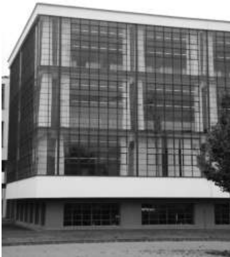
Figure 02. Bauhaus

On the other hand, Rowe and Slutzsky define phenomenal transparency as something that is perceived as a result of juxtaposition of several elements. This is best exemplified in the painting by Fernand Leger, The Three Faces , where the perception of transparency is the result of putting elements in certain order leading to an illusion of obstruction free vision. In terms of architecture, Villa Garches by Le Corbusier is used as an example to describe phenomenal