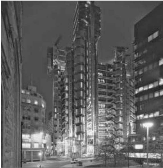
Figure 08. Lloyd Building by Richard Rogers