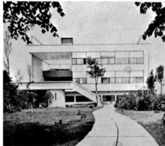
Figure 04. Villa Garches

In a more recent discussion regarding phenomenal transparency, Eve Blau (2007) suggests that transparency is the concept of continuous space, inside-out space, the space that can be experienced no matter where we are, either outside or inside. Blau quotes Kazuyo Sejima of SANAA as stating that