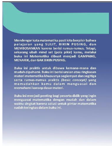
Figure 3. Back cover of Student textbook

Third, the back cover of a rectangular and triangular pocket book as a medium of learning for junior high school students.