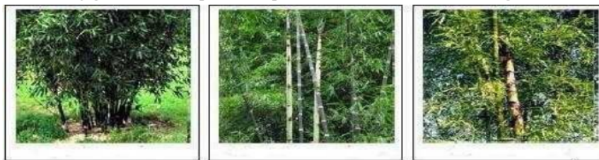
Figure 3. Three types of bamboo are often used as ground cover plants. From left to right: Gigantochloa apus , Dendrocalamus asper , and Bambusa bambos

The selection of ground cover plants in addition to meeting the requirements, should also consider the economic benefits of plants. It is hoped that, apart from being useful in preserving the environment, local residents can also earn additional income from these plants. One example of a plant that meets these criteria is bamboo. Bamboo has a strong fibrous root structure that is able to withstand the rate of erosion. The growth of bamboo clumps is also very fast and environmental tolerance is very high, and has the ability to improve effective water catchment sources so it is very suitable for reforestation in open or deforested forests due to logging (illegal logging). Bamboo plants are also very good for use as protective plants on river cliffs or ravines (Figure 3)