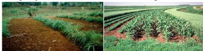
Figure 4. Planting Strip Cropping System

Planting in strips (strip cropping) is a method of farming with one or several plants, where each type of plant is planted in alternating strips, on a plot of land and arranged according to contour lines or cutting the direction of the slope. Planting in strips has the aim of slowing the runoff rate, protecting the plant rows from the effects of runoff (Figure 4).