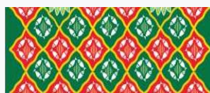
Figure 3. Multiplication Concept on Batik Pattern Tokhubuknonas

In the Tokhubuknonas batik motif, there is also a concept of comparison. This can be seen from the comparison of the number of images on the batik pattern pieces. In the image below, the ratio of the number of red squares to the total number of squares in the form of fractions is \frac{12}{25} while the number of green squares from the total number of squares is \frac{13}{25} . To get the value of the numerator, use the concept of multiplication. To be more clear, look at Figure 2.