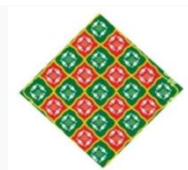
Figure 2. Comparison Concept on Batik Pattern Tokhubuknonas Source: (Nasution, 2018)

In the Tokhubuknonas batik motif, there is also a concept of comparison. This can be seen from the comparison of the number of images on the batik pattern pieces. In the image below, the ratio of the number of red squares to the total number of squares in the form of fractions is \frac{12}{25} while the number of green squares from the total number of squares is \frac{13}{25} . To get the value of the numerator, use the concept of multiplication. To be more clear, look at Figure 2.