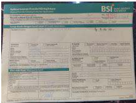
WhatsApp Image 2022-11-17 at 02.02.41 (1).jpeg 115K