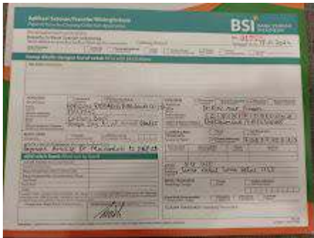
WhatsApp Image 2022-11-17 at 02.02.41.jpeg 133K