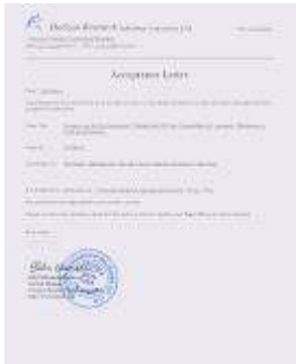
Acceptance Letter_10428650.jpg 425K