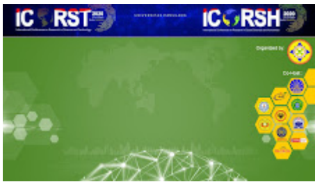
Peserta Conference.jpeg 153K