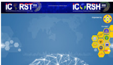
Panitia Conference.jpeg 156K