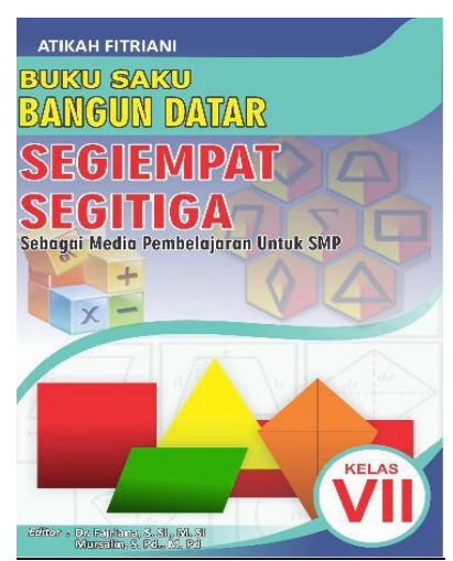
Figure 1. Front cover of Student textbook

The researcher presents the front cover, layout, and back cover of the rectangular and triangular shape pocket book as learning media for SMP that was developed. First, the cover of the front cover of a rectangular and triangular pocket book as a medium of learning for junior high school students.