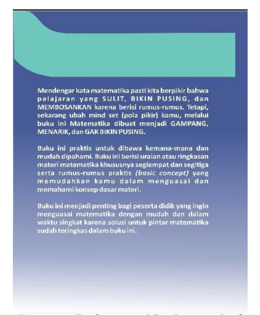
Figure 3. Back cover of Student textbook

Third, the back cover of a rectangular and triangular pocket book as a medium of learning for junior high school students.