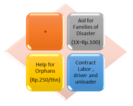
Figure 4: Economic Impact

According to Datok Tanjong Semantok, Tanjong Semantok POM assisted orphans as much as Rp. 250.000- in a year. Then there is also assistance for big holidays, but it is very little and does not match the community's expectations because it is only given around Rp. 100,000 to Rp. 200,000,only. Assistance for disasters is also provided every time there is a disaster, but it is only given to the community from delivering news of old disasters. Then there was also assistance to build badminton facilities, and there were provided iron poles for badminton courts. There is also assistance for borrowing heavy equipment such as tractors if the community needs it. For the workforce used by the people of Kampung Semantoh, only one as an employee, there has been no other for a long time. Schematically, the economic impact can be seen in the following scheme: