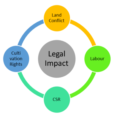
Figure 2: Legal Impact

governments must follow. This policy supports the availability of non-oil and gas fuels in facing the shortage of oil and gas availability by choosing alternative fuels. Policies that strongly support the existence of oil palm companies must be the basis for strengthening the rights of the people in Aceh Tamiang. Schematically, the impact of biodiesel development from a legal aspect can be seen in the following graph: