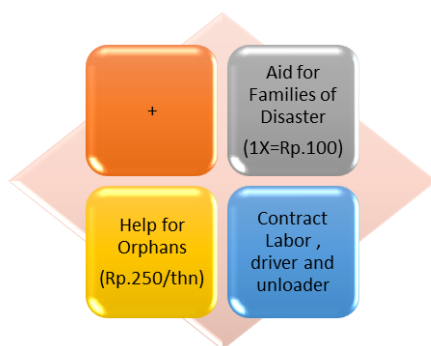
Figure 4: Economic Impact

According to Datok Tanjung Semantok, Tanjung Semantok POM assisted orphans as much as Rp. 250.000- in a year. Then there is also assistance for big holidays, but it is very little and does not match the community's expectations because it is only given around Rp. 100,000 to Rp. 200,000,- only. Assistance for disasters is also provided every time there is a disaster, but it is only given to the community from delivering news of old disasters. Then there was also assistance to build badminton facilities, and there were provided iron poles for badminton courts. There is also assistance for borrowing heavy equipment such as tractors if the community needs it. For the workforce used by the people of Kampung Semantoh, only one as an employee, there has been no other for a long time. Schematically, the economic impact can be seen in the following scheme: