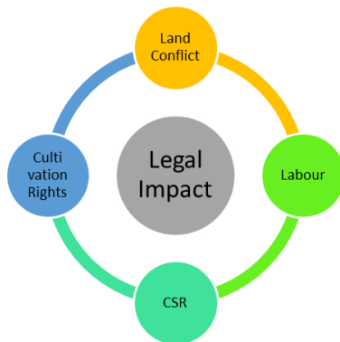
Figure 2: Legal Impact

governments must follow. This policy supports the availability of non-oil and gas fuels in facing the shortage of oil and gas availability by choosing alternative fuels. Policies that strongly support the existence of oil palm companies must be the basis for strengthening the rights of the people in Aceh Tamiang. Schematically, the impact of biodiesel development from a legal aspect can be seen in the following graph: