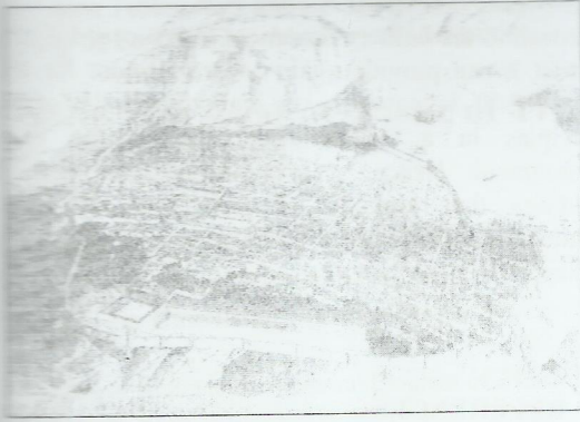
Fig. 1. Illustration of Priene City

In the West for example, before the widespread exploitation of fossil fuels the main energy was wood. As wood became scarce, it seemed natural to many citizens to make use of heat from the sun to reduce the need for wood to provide heat. The ancient Greeks were well aware of the benefits of solar design, and commonly arranged their houses to collect the rays of the winter sun. Greek cities such as Priene, following its relocation to avoid flooding were laid out on a grid plan with street running east-west to allow a southerly orientation of the buildings. The Romans continued the solar design principles that they learned from their contacts with the Greeks, for examples, they were able to make use of window glazing, developed in the first century, to increase the heat gained during winter into the building. The tradition of designing with climate to achieve comfort in buildings is not confined to the provision of warmth aspects. In many climates the problem that faces the architect is to cool the spaces in order to achieve a comfortable condition. The conventional modern solution is the provision of air conditioning systems which is no longer a crude process of opposing climate with energy, which was foolish when energy is cheap and pollution not considered, but is now verging on the insane.